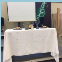
The Lord's Supper